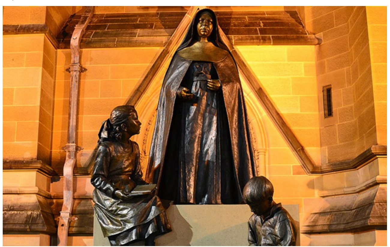
Prayer for the beginning of a new term

Almighty God We give you our school. We give you all the teachers and staff who work here, We give you all the students who learn here. We pray our school will continue to be a place of great discovery, adventure and creativity. May it be a place where we love to learn and where we learn to love, A place where everyone is respected, and all are deeply valued. We ask all this through Jesus Christ