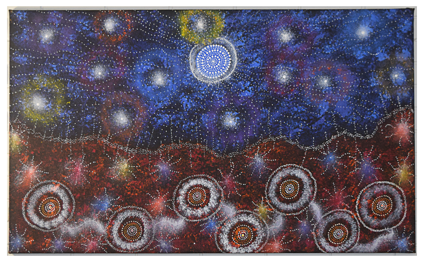
Mary MacKillop College acknowledges and pays respect to the Kaurna people, the traditional custodians whose ancestral lands we gather on. We acknowledge the deep feelings of attachment and relationship of the Kaurna people to country and we respect and value their past, present and ongoing connection to the land and cultural beliefs.