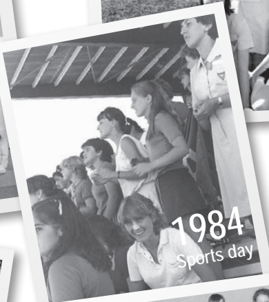
1984 Sports day