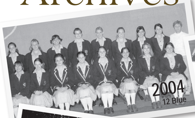
2004 12 Blue