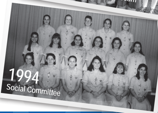
1994 Social Committee