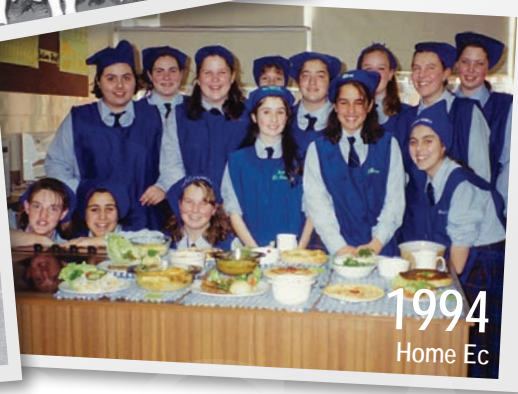
1994 Home Ec