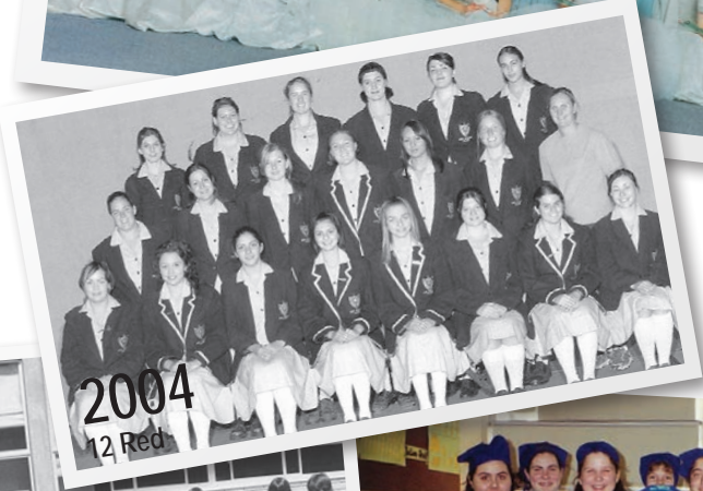
2004 12 Red