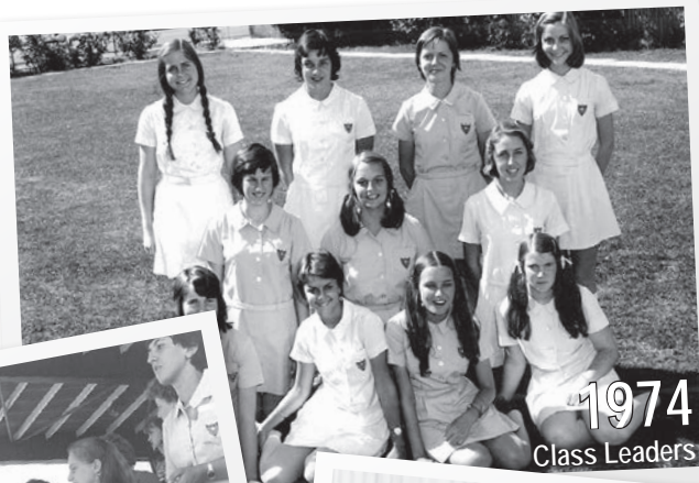
1974 Class Leaders