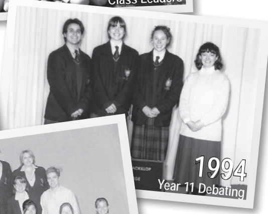
1994 Year 11 Debating