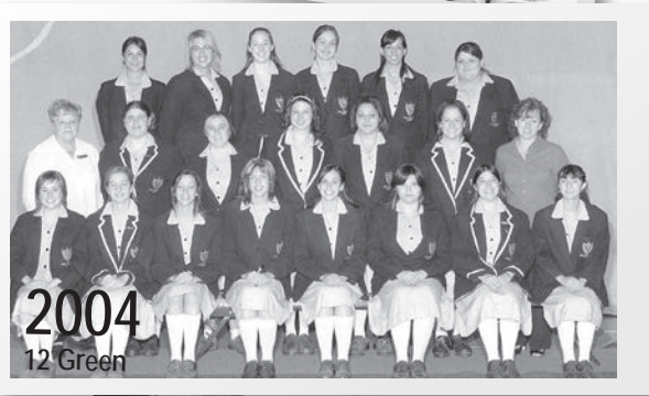
2004 12 Green