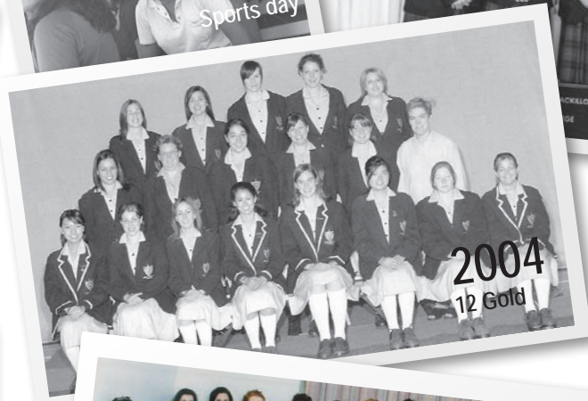
2004 12 Gold