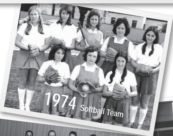
1974 Softball Team